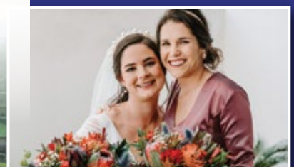
OLD GIRL ANNOUNCEMENTS Pages 10 - 14

We will be having an Old Girls' Committee Get Together early in 2022.