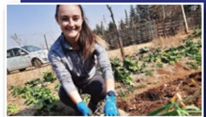
OLD GIRL NEWS Throughout