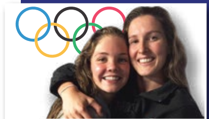
OLD GIRLS MAKING NEWS Pages 4 - 6