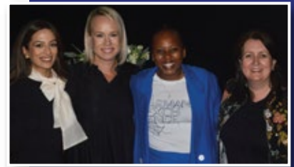
CLASS OF 2021 WELCOME TO THE GUILD Page 2